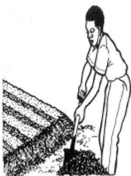
Apply a mulch