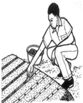
Cover with sandy soil