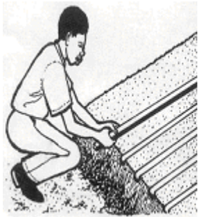
Make a shallow furrow