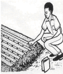
Plant the seeds