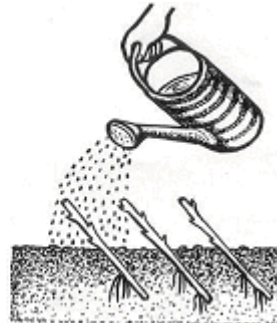
Water the cuttings