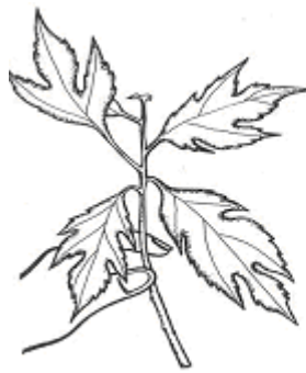
Select a mature stem