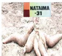
Fig. 3 Root yield, Nataima-31