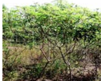
Fig. 2 Nataima-31 plant type

The original cross resulted in 128 progeny and these were evaluated for whitefly resistance, yield and cooking quality at the CORPOICA Research Station in Espinal, Tolima, Colombia. Of the 128 progeny, four (CG 489-34, CG 489-31, CG 489-23 and CG 489-4) were selected for low whitefly populations and no damage as well as the agronomic qualities described above. Nataima-31 is the 31 st progeny of the 128 that were evaluated (Bellotti, 2003).