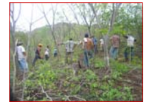
Validation in Nicaragua

Interaction between farmers (practitioners and those interested in the validation of the system) allowed to identify the main short-term and long-term benefits of the system: reduced soil and water losses, increased crop yields, steady fuel wood supply and reduced labor