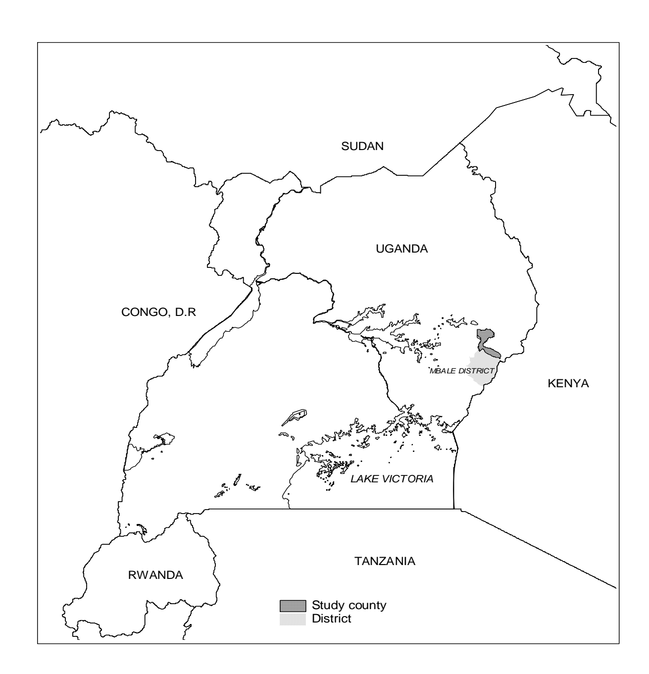
Figure 1. Map showing study county