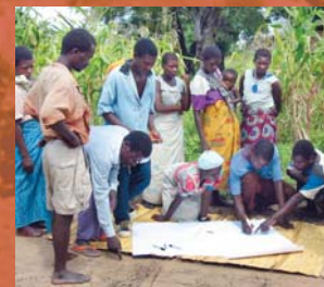
Resource mapping is a useful participatory tool. Farmers are asked to draw a map of their community beginning with boundaries, and adding houses, roads, and crops. This process allows the group to think of what they have and build up a picture of their assets.

This approach can enable local stakeholders to respond to new challenges and opportunities in the marketplace. Building capacity of local development agencies to use this approach can help entrepreneurs in the long term, once project work has been phased out.