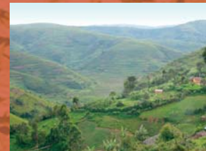
The project's area of operation can be defined by a local political area, a diocese or a cluster of villages. Sometimes, a project may operate over a larger physical domain such as a watershed or an agro-ecozone.

The agro-enterprise method comprises several steps: (1) developing project site partnerships and resource assessment; (2) market analysis; and (3) intervention design, implementation, and scaling up.