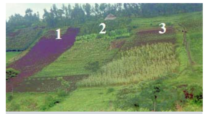
Figure 1. Three farms on steeply sloping land in southern Ethiopia with good (2) and poor (1, 3) management. Household no. 2 resides on the farm.

population pressure often obliges farmers to utilize vulnerable, sloping land with aggravated erosion and degradation (Figure 1). A major concern of many stakeholders in highland areas, besides maintaining the fertility of lands that are still productive, is how to rehabilitate degraded arable lands that are on the verge of going out of production. The Tropical Soils Biology & Fertility Institute of CIAT (TSBF) and the African Highlands Initiative (AHI), working together with the