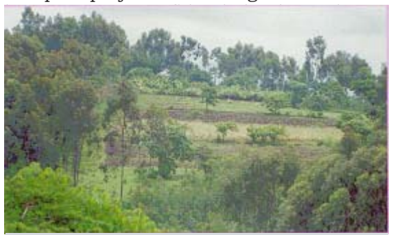
Figure 4. A well-managed farm in southern Ethiopia with integration of soil conservation measures, trees and high value crops.

Soil fertility management is a continuous process. Besides addressing current nutrient deficiencies, other measures are also needed to ensure sustainable soil productivity. The farmers collaborating in this pilot project have now gone on to