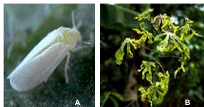
Fig. 1. A: Biotype "B" B. tabaci ; B: Cassava leaves affected by ACMV

To date, a total of 24 biotypes have been identified in different regions of the world, which suggests that B. tabaci may be a complex of species and biotypes undergoing continuous evolutionary changes (Perring, 2001). Biotype B of B. tabaci is a recognized pest in cassava crops in Asia and Africa, where it transmits the African cassava mosaic virus (ACMV) (Fig. 1B).