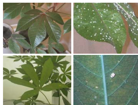
Fig. 3. Populations of biotype B on jatropha and cassava

Population parameters suggested an increase in the capacity for adapting to the cultivars of M. esculenta , favored by the influence of phylogenetically related hosts such as J. gossypifolia . This might act as gradual points in which insect populations undergo an increase in their biotic potential, thereby facilitating their adaptation to M. esculenta (Fig. 3). Indeed, this fact constitutes one of the principal findings of this study, as it makes possible determine the adaptive capacity of biotype B on M. esculenta , which, according to Costa and Russell (1975), represents a "dead host", in the Americas.