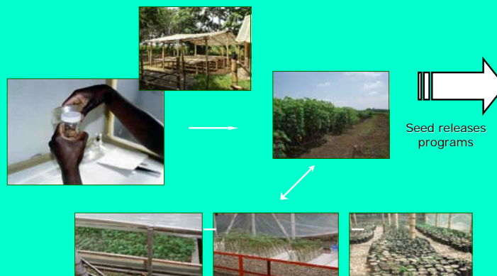
Figure 1: Rural low-cost in-vitro facilities. Rapid propagation and increment field for basic seeds