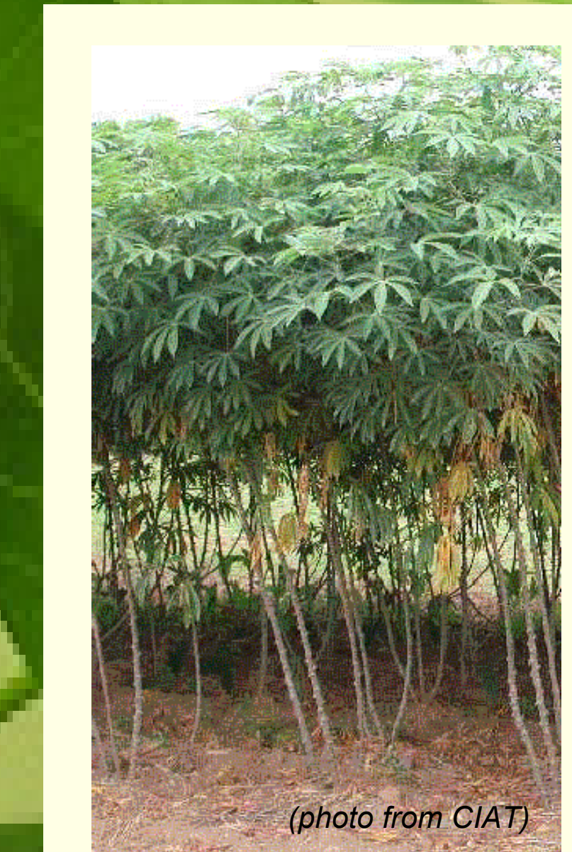
M. esculenta ssp. esculenta cassava

A QTL mapping approach will be used for identifying and estimating the effect of individual QTLs controlling trait differences between cassava and M. esculenta ssp. flabellifolia .