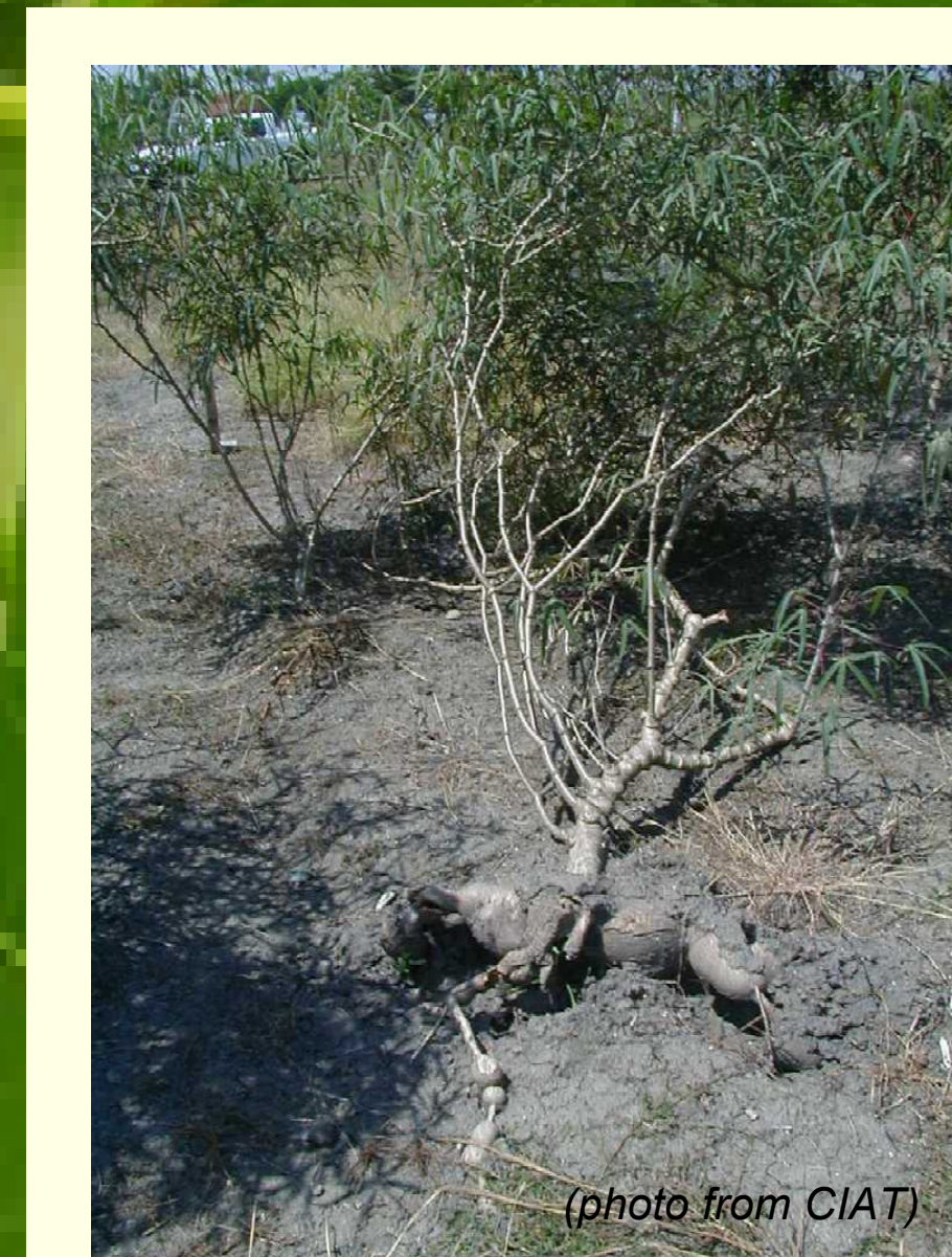
M. esculenta ssp. flabellifolia

A close genetic relationship has been found between the wild Manihot esculenta ssp. flabellifolia and the cultivated cassava. M. esculenta ssp. flabellifolia is therefore suggested to be the ancestor of cassava (7) .