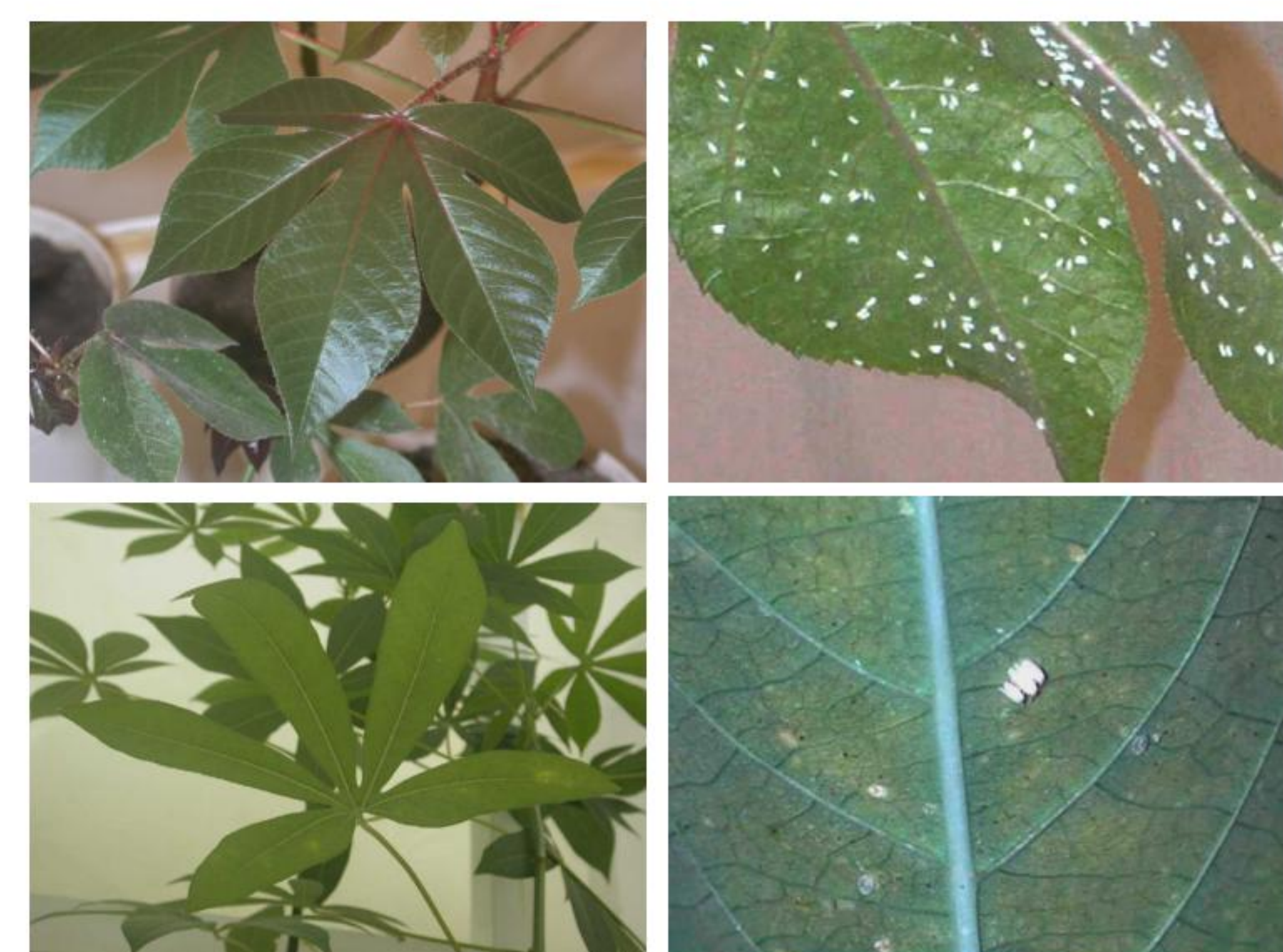
Fig. 3. Populations of biotype B on jatropha and cassava

Population parameters suggested an increase in the capacity for adapting to the cultivars of M. esculenta , favored by the influence of phylogenetically related hosts such as J. gossypifolia . This might act as gradual points in which insect populations undergo an increase in their biotic potential, thereby facilitating their adaptation to M. esculenta (Fig. 3). Indeed, this fact constitutes one of the principal findings of this study, as it makes possible determine the adaptive capacity of biotype B on M. esculenta , which, according to Costa and Russell (1975), represents a "dead host", in the Americas.