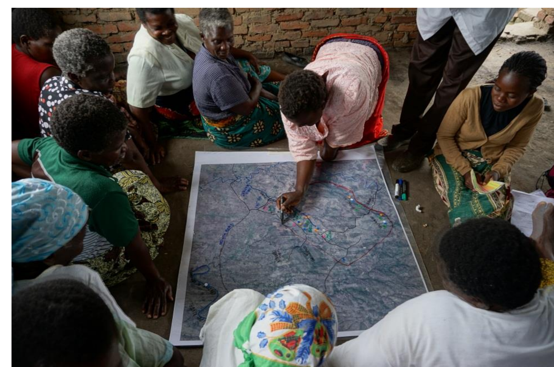
Community members use Google Earth Pro images to map how they use the land including resources and the state of those resources.