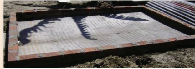
Figure 2. Floor surface of a rachis compost shelter.