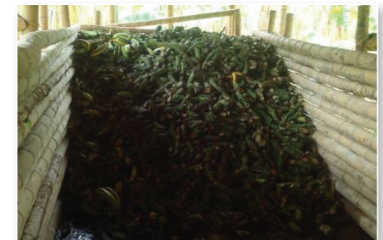
Figure 5. Rachis stored inside the shelter.

Rachis of recently harvested bunches are selected, discarding those showing symptoms of Moko disease. The selected rachis are then chopped into pieces and placed in the compost shelter (Figure 5).