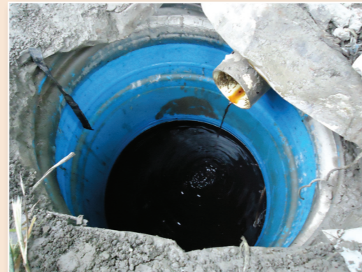
Figure 3. Drainage pipe and collecting container.