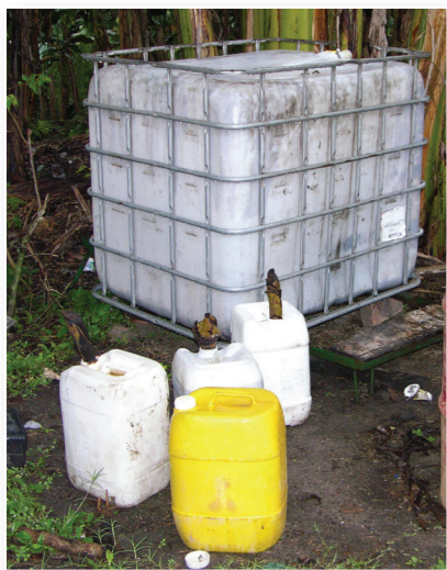
Figure 6. Lixiviates stored in plastic containers.

Because they are highly corrosive, store lixiviates in lidded or capped plastic containers, not metal ones (Figure 6). Leave the lixiviates to rest, or cure, for at least 30 days before use.