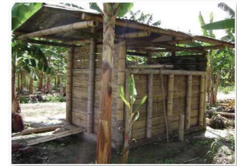
Figure 4. Walls and roof of the compost shelter.