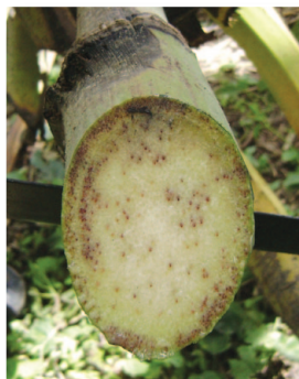
Necrosis and blocking of vascular bundles in the floral rachis.