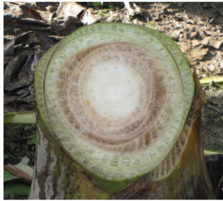
Necrosis in vascular bundles.