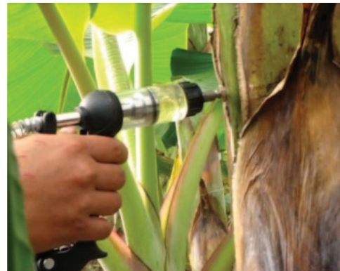
Eliminating plants from the Red Zone.