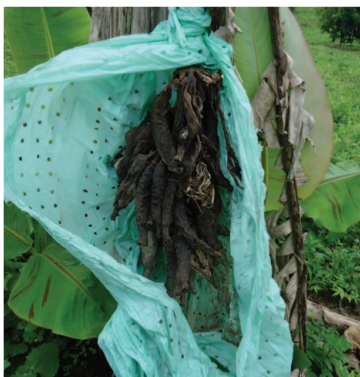
Necrosis in fruits causes loss of the bunch.