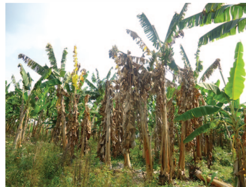
Infection focus, showing eradicated plants.