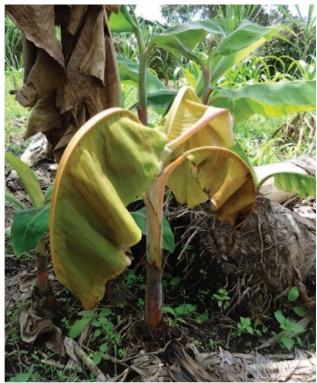
Wilting and necrosis in plants but note the asymptomatic suckers.