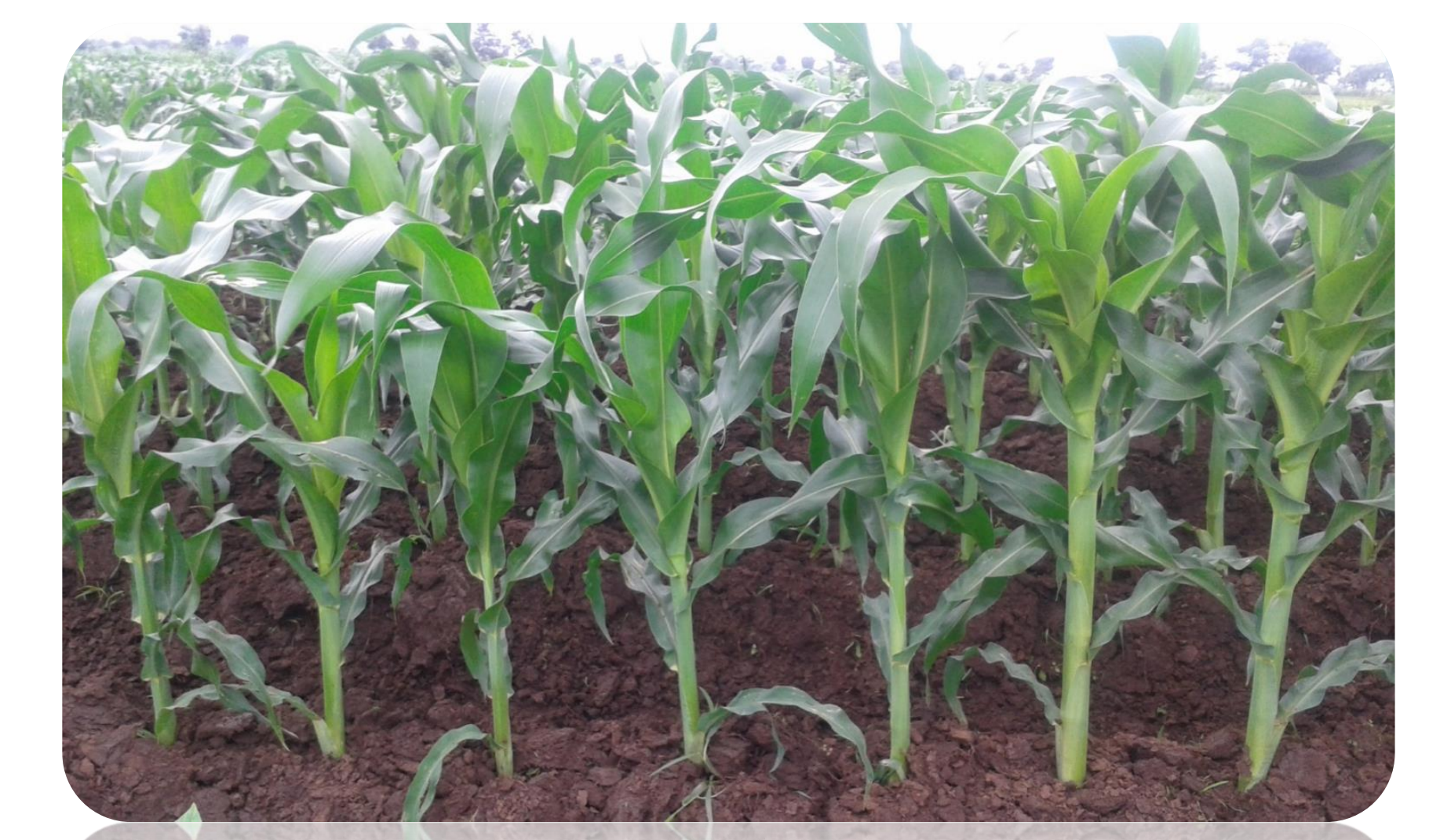
During the early part of the season, maize crop was very promising (Figure 1a).