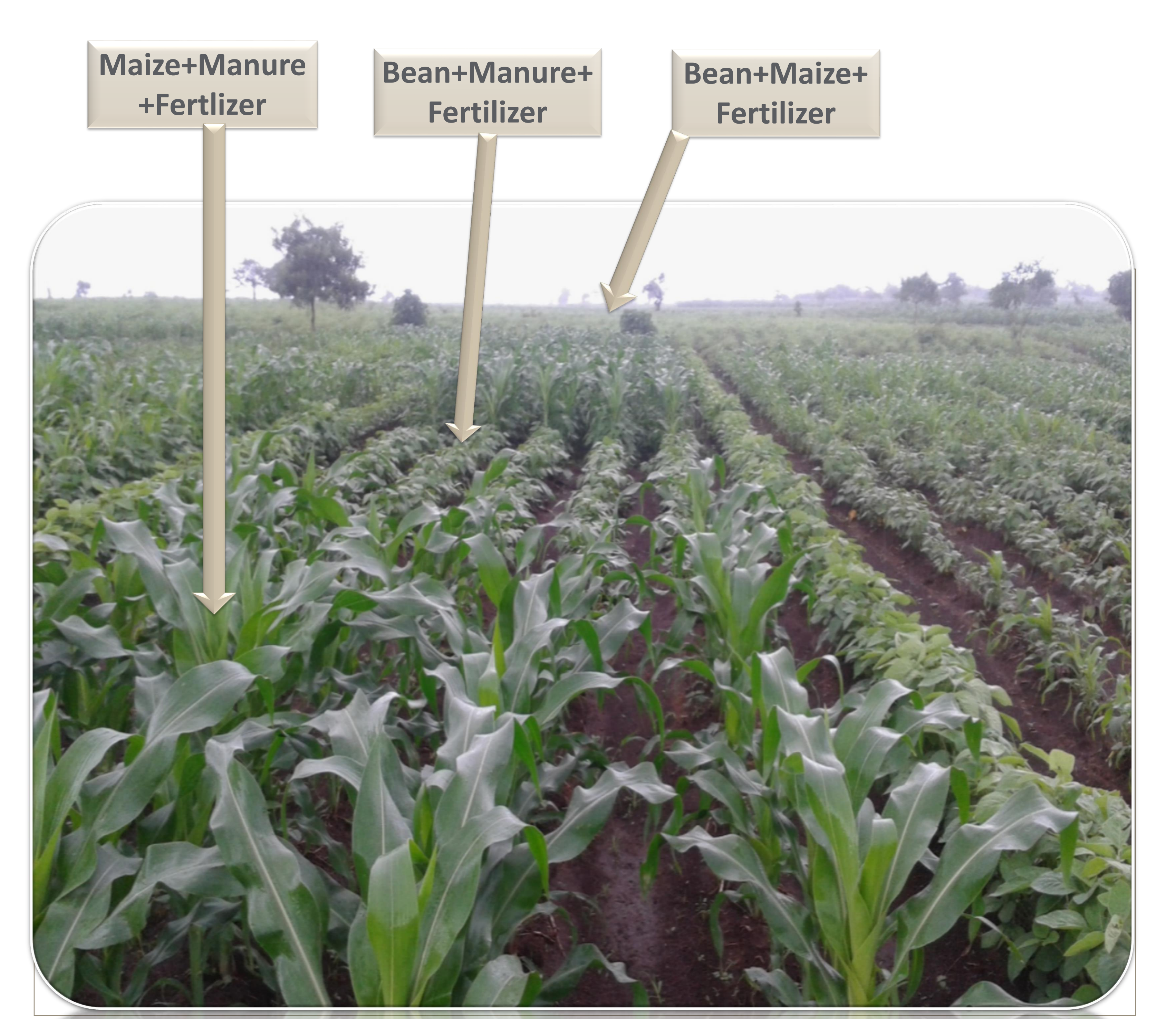
Figure 1: Part of the treatments in a mother trial at Mbibzi in Dedza

Participatory Technology Evaluation (PTE) was conducted with both participating and non-participating farmers.