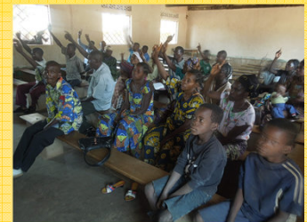
PRA in Kamanyola – Walungu territoire 02° 44'13.7" S, 29° 00'04.2" E, 973 m asl.