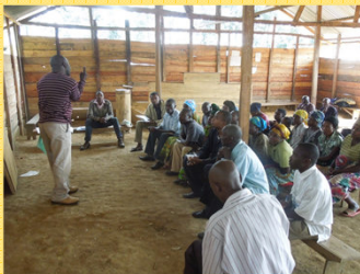
PRA in Muhongoza – Kalehe territoire 02° 04'10.4" S, 28° 53'54.6" E, 1585 m asl.