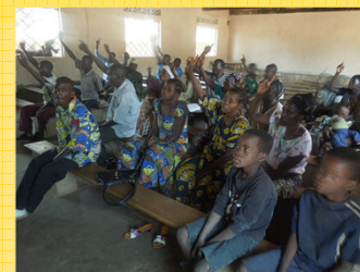
PRA in Kamanyola – Walungu territoire 02° 44'13.7" S, 29° 00'04.2" E, 973 m asl.