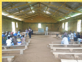
PRA in Tubimbi – Walungu territoire 02° 48'44.2" S, 28° 35'28.8" E, 1073 m asl.