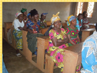
PRA in Cirunga – Kabare territoire 02° 29'46.4" S, 28° 47'26.0" E, 2001 m asl.