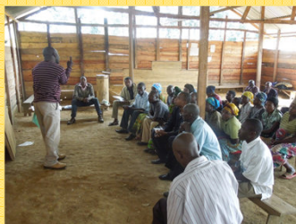
PRA in Muhongoza – Kalehe territoire 02° 04'10.4" S, 28° 53'54.6" E, 1585 m asl.