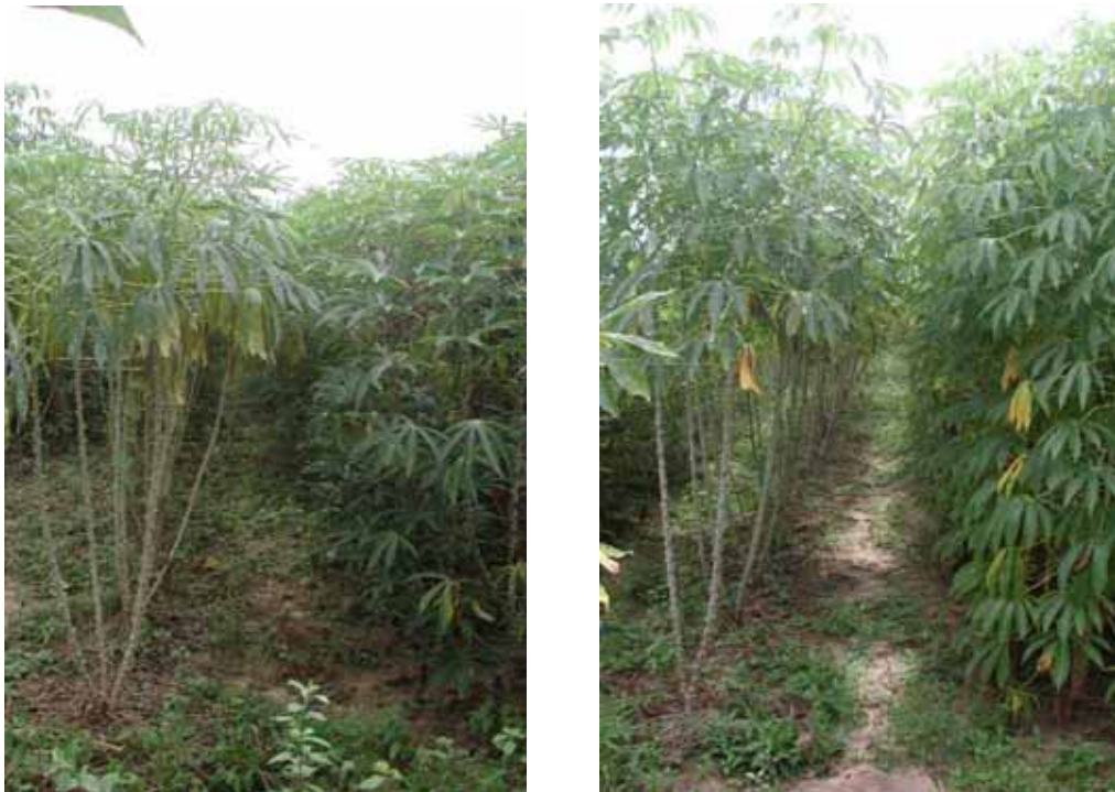
Figure 3. Differences in leaf retention as observed in the Clonal Evaluation at Santo Tomás, Department of Atlántico, Colombia. At 5½ months, some families were retaining leaves while others had significant leaf fall.