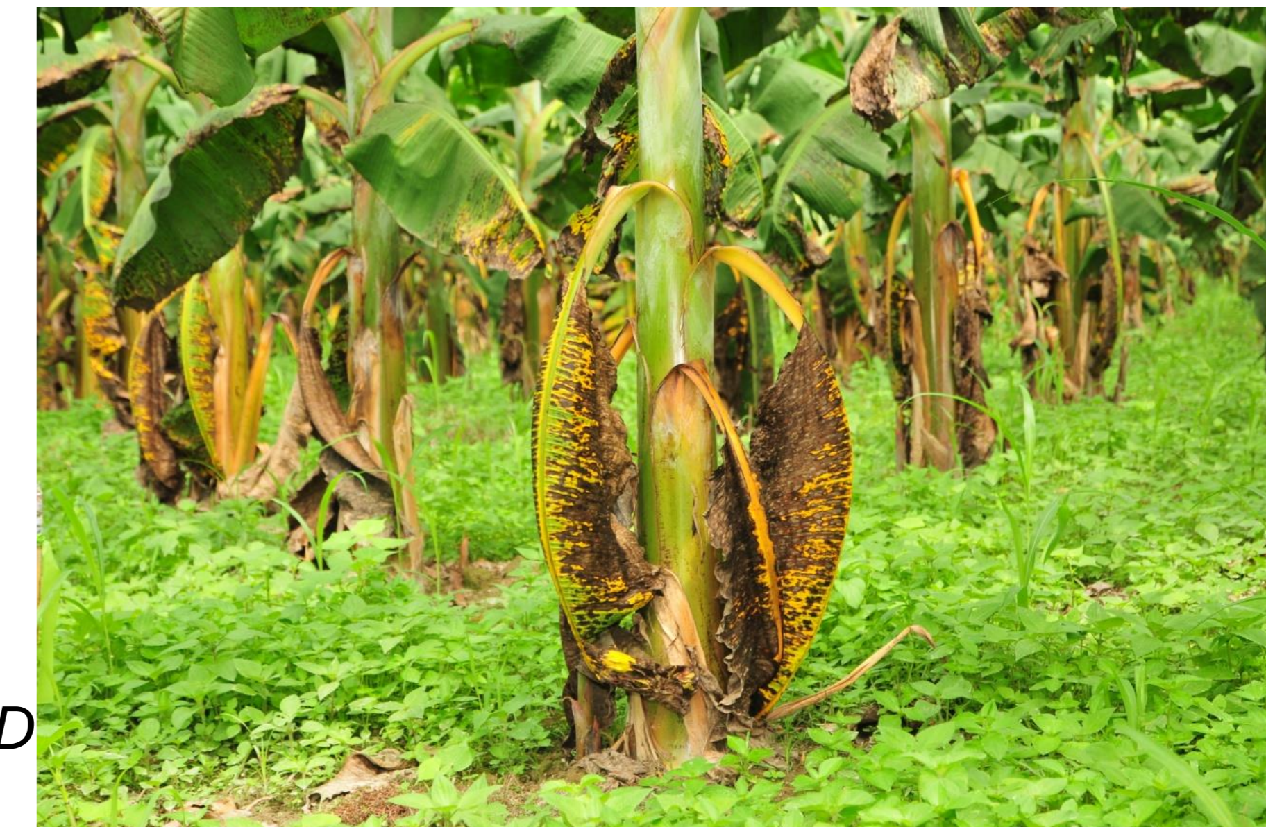
Figure 1. Plantain plants affected by BLSD in a study trial

To adopt effective control strategies that reduce costs, the factors behind disease progress in a host plant must be understood. To design an eco-efficient approach to managing BLSD, we evaluated the relationship between the disease's temporal dynamics and foliar emission rate (FER) in plantain.