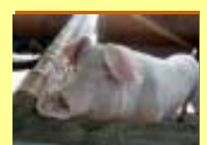
Legume meals for monogastrics