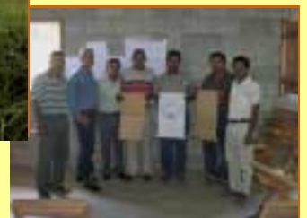
Farmer group PRASEFOR