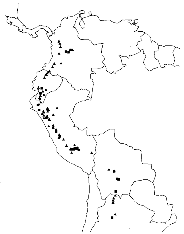
Fig. 1. Geographic distribution of wild and cultivated accessions drawn from the Andean countries of Colombia, Ecuador, Peru, Bolivia and Argentina, and included in an analysis by amplified fragment length polymorphism. Squares represent wild accessions and triangles represent landraces.

DNA was extracted and AFLP analysis was performed as per Tohme et al. (1996), using primer combinations that had proven to reveal ample polymorphism. AFLP were read as present or absent, and the resulting data matrix including both wild and landrace accessions was analyzed by MCA (SAS, 1989). MCA is a multivariate technique similar to principal components analysis, but in which the distance between indi-