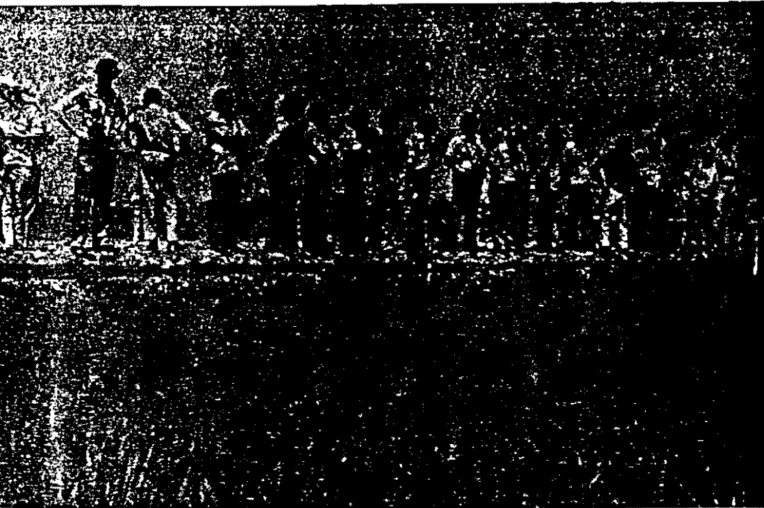
Participants observe the demonstration plots of outstanding rice varieties.