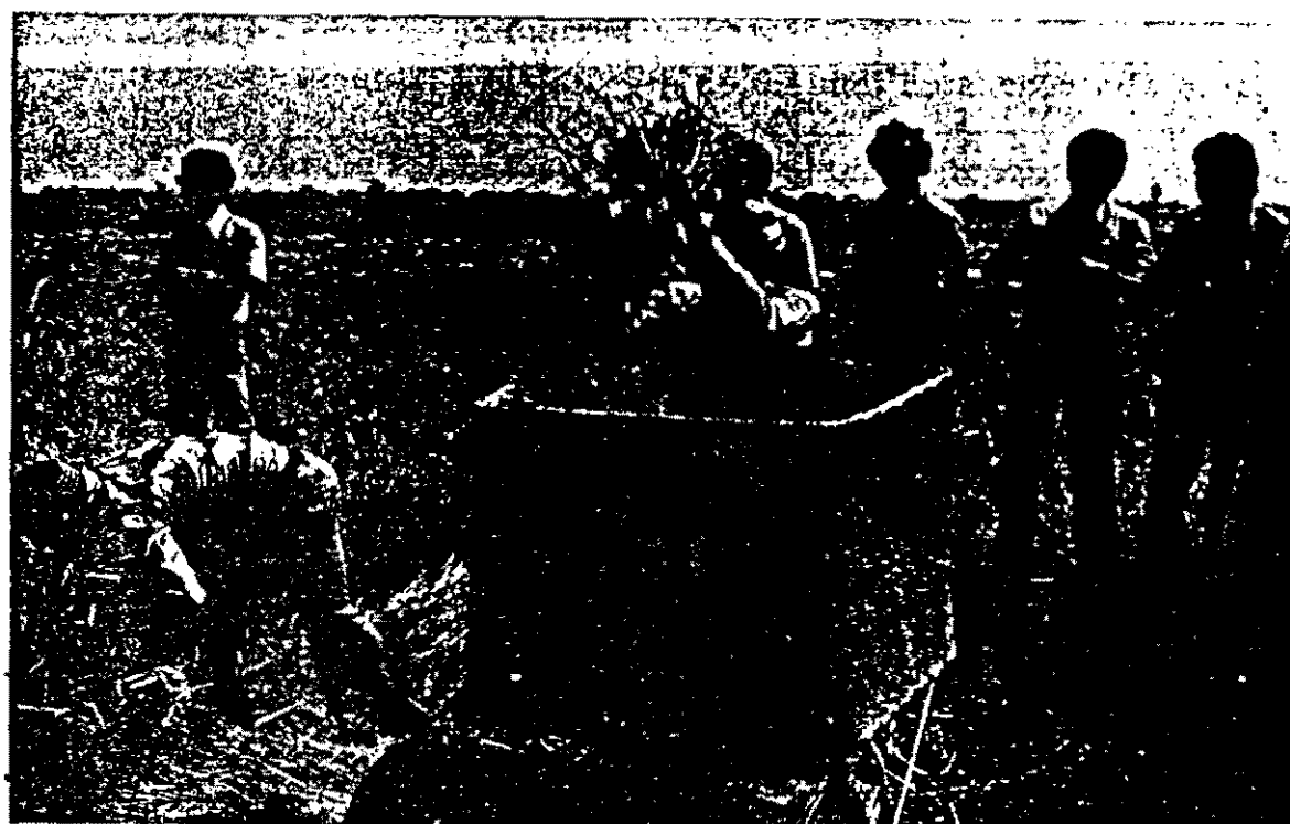
Participants observe how laborers cut and thresh rice using a portable thresher developed at CIAT.