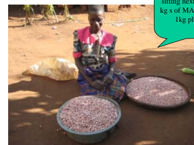
A farmer in Mozambique, proudly sitting next to her 30 kg of MAC 12 from 1kg planted

Seed of client oriented bean genotypes were being multiplied in all the sites across the two transects. A total 600 farmers were participating in multiplying these varieties either as individuals or as groups. The quantities being multiplied varied from site to site depending on the 2007/08 harvest. In the 2008/09 season the program was scaled up to 30 new communities under the new partner Total Land Care