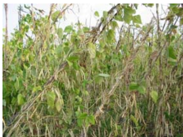
Seed multiplication at Bwanje Irrigation Scheme

CIAT – SABRN has been bulking up breeders' seed of promising climbing bean varieties for PVS trials on new sites, and fast track seed multiplication with initial farmer groups and their partners. In 2008 a total of more than 20 kg of seed per variety was produced for the 20 promising varieties at the Bwanje Irrigation Scheme, and this was used for the subsequent trials in 2009 and farmer seed production.