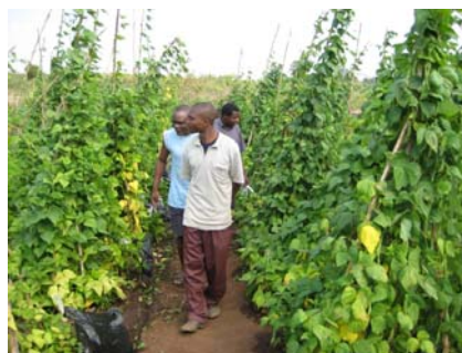
Farmers evaluating varieties at vegetative stage in Thyolo district - Malawi

A diverse group of clients: farmers, traders, local hoteliers and other consumers are being exposed to promising climbing bean varieties for their input in selecting new bean varieties based on pre- and post-harvest traits. Stakeholders disaggregated by gender evaluated the varieties for positive as well as negative attributes using ribbons of different colors which they placed in plastic bags next to each variety