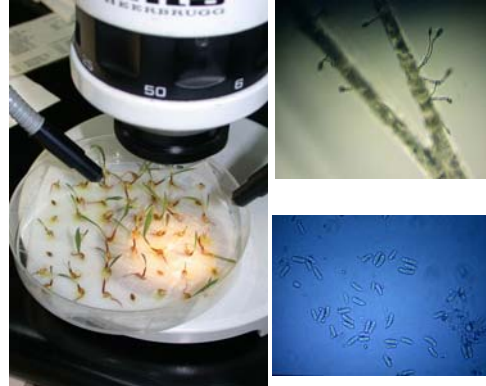
Figure 2. fungi identification growing on either seed or media.

Bacterial isolates that were grown on nutrient agar were streaked on the same PDA plate at the opposite edge of the fungal section and keeping the bacteria and fungal isolates separated by about 7 cm.