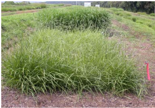
Figure1. Regeneration and multiplication of Brachiaria , grass germplasm.

Regeneration and multiplication of Brachiaria grass germplasm are normally carried out under field conditions in Popayán (2°25'n;76°40'w, altitude 1750 m.a.s.l.), Colombia (Fig1). Under such conditions fungi, such as Drechslera ., Phoma ., Curvularia ., Sphacelia ., Cerebella ., Curvularia and Fusarium can either infest or infect seeds and significantly reduce the quality of the seed produced and stored. Trials with different fungicides proved to be inadequate for disease control. We used an antagonistic bacteria as a preliminary approach of biological control of these fungi.