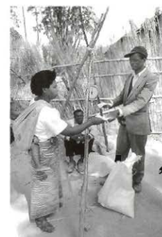
Farmers are being encouraged and helped to develop their bean production capacity in order to capitalise on lucrative local and regional bean markets.