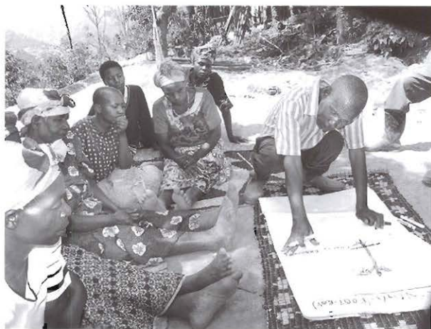
Farmer participatory experiments have been successful in supporting the sustainability and competitiveness of their agroenterprises, strengthening their capacity and generating information for decision-making.

fast track lines with HIV/AIDS-affected communities continued. Two well performing climbers (Ngwinurare and VNB 81010) and three iron- and zinc-rich bush bean varieties (AND 620, MLB-40-89A and MLB-49-89A) were evaluated across selected agro-ecological zones. Among five performing micronutrient rich varieties (Ngwinurare, VNB 81010, Maharagi Soya, MLB-40-89A, & AND 620) that were tested, Ngwinurare, Maharagi Soya and AND 620 were preferred by smallholder farmers in communities affected by HIV/AIDS, due to their high yield and pleasant taste. These varieties have been disseminated across target regions to nineteen associations of PLWHA and other vulnerable groups. Seed multiplication is ongoing in seven focal health and nutrition centres based in five provinces. A number of locally available complementary crops