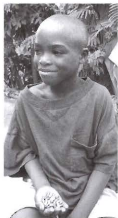
PABRA partners aim to reach millions of end-users with technologies that have the potential to make a positive difference to their livelihoods through a 'wider impact' approach.

165-96-Chercher). Twelve candidates have been proposed by the FOFIFA bean programme for release in Madagascar. These included four large white, red mottled and kidney grain types with acceptable export quality, tolerance to disease and to low soil fertility.