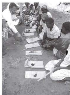
Participatory variety selection has been a successful approach used with farmers and partners in introducing improved bean varieties to communities and is being integrated in breeding programmes in Southern and Eastern Africa.

Through concerted efforts of the PABRA–NARS partners and their rural service providers, tremendous progress was made to provide bean-based technologies to a total of 922,847 households in 2006. The households were in Burundi (48,000), Ethiopia (352,700), Kenya (170,000), Mozambique (20,000), Rwanda (160,000), South Africa (3,000), southern DR Congo (20,150), Tanzania (64,500), Uganda (43,500) and Zambia (40,000). One hundred and ninety eight partners reached these households across the ten countries. Households were reached with technologies (varietal and non-varietal) that had been developed through farmer participatory approaches. Factors that influenced technology choices included accessibility, cost effectiveness of the technologies, and gender dimensions of resource ownership. For example, it was noted that green manure was favoured by women, as they do not own, or have access to any means of carrying manure to the fields. A seed distribution study conducted in Tanzania (Babati district) revealed that seed saved from farmers' own production constituted the main source of planting seed (44%) across six selected villages.