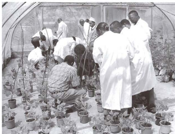
As a monitoring and evaluation function, PM&E provides regional networks and national partners with the mechanisms for monitoring progress of bean-related activities against regionally and nationally defined milestones.

The partnerships established within and between networks have widened and improved through the operation of more integrated frameworks such as seed systems, PM&E etc. Across the eighteen PABRA countries, the partnership approach is being integrated into national bean research programmes' (NBRPs) activities and interventions. The approach is also highly valued by NBRPs partners. For instance, in Madagascar, a platform of bean commodity actors was established two years ago and is chaired on a rotational basis. It includes the FOFIFA-NBRP, bean exporters, NGOs working in development and promotion of beans, and government seed services. Since its creation, platform members have had the opportunity to share responsibilities such as training, establishment of participatory variety selection, and sharing of seeds of different preferred varieties.