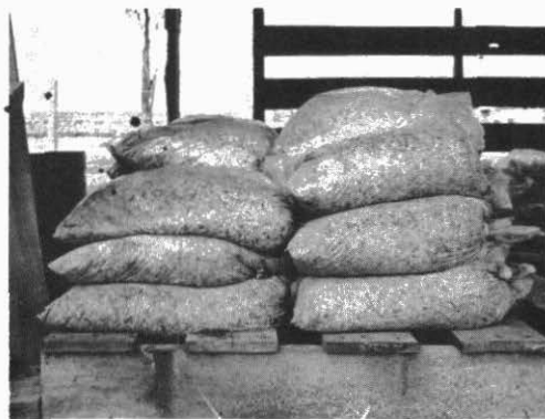
Figure 2. Cassava root ensilage stored in polyethylene bags.