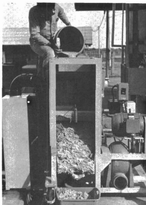
Figure 4. Partial extraction of water from single-cell protein biomass, utilizing a filter-press constructed at the University of Guelph, Canada.