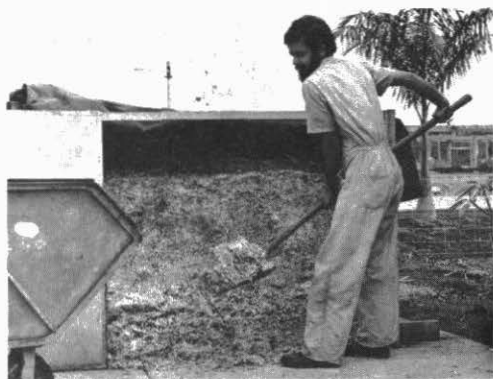
Figure 1. Silo made of wooden sides covered with sheet metal for conserving cassava roots.

Cassava roots were washed to remove excess dirt and then were cut in small chips with a mechanical chipper. These chips can be packed in silos (Fig. 1) when it is necessary to preserve considerable quantities of the product, or in polyethylene bags (Fig. 2), for small quantities.