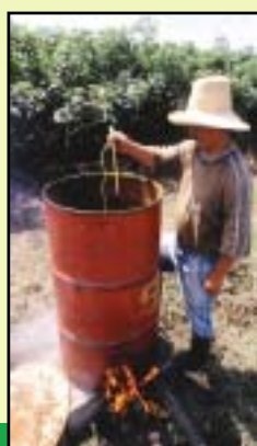
Heat water to 49 °C over a wood fire and introduce stem cuttings

Thermotherapy: Stem cuttings were immersed for 49 minutes in water heated to 49 °C over a wood fire (Figure 1).