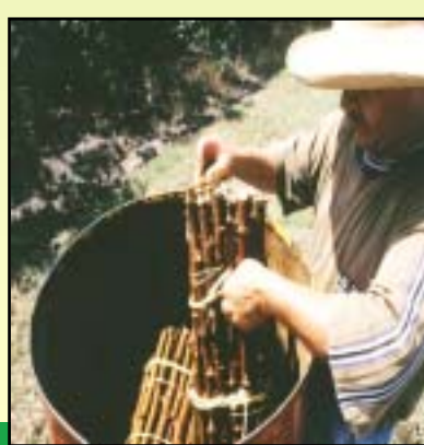
After 49 minutes, remove the stems and plant the treated seed