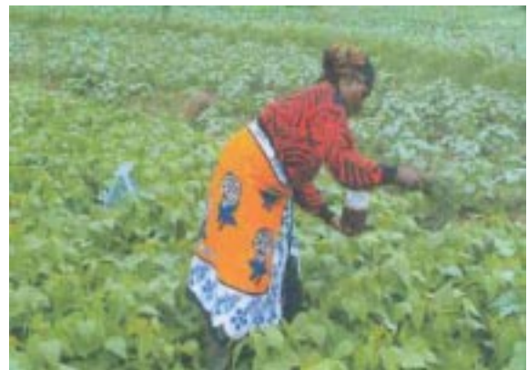
Farmer demonstrating use of "Mfori" for Ootheca management

The approach gives the extension service an opportunity to reach more farmers with a range of appropriate technologies by which they can solve complex problems, without assuming that one solution or package suits all. At the request of farmers, the extension service is now using this approach across a wide range of issues including integrated soil fertility management with a range of crops.