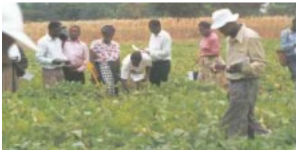
Farmer evaluate experiments with extension personnel

The extension service and researchers participate in these activities and support the farmers with other extension materials developed in collaboration with the farmers.