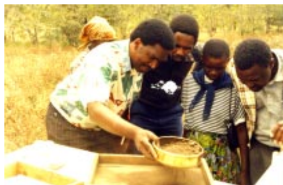
Researchers and farmers sampling field for foliage beetle larvae and pupae

Researchers guided farmers through participatory studies of pest development, showing the distribution of its life stages above and below ground. Farmers gained a better understanding of the pest's ecology and population dynamics, and were then able to identify and try out more appropriate solutions for integrated pest management (IPM).