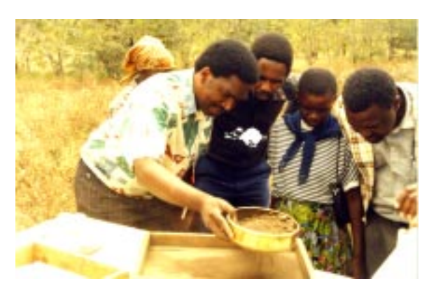
Researchers and farmers sampling field for foliage beetle larvae and pupae

chers guided farmers through patory studies of pest development, mowing the distribution of its life stages above nd below ground. Farmers gained a better understanding of the pest's ecology and population dynamics, and were then able to identify and try out more appropriate solutions for integrated pest management (IPM).