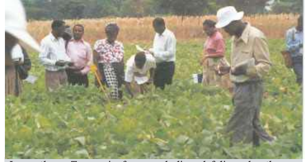
In northern Tanzania farmers believed foliage beetles "came with the rains and got drowned if the rainfall got heavy." As a result the only solution they offered for control was "rain".

They become special problems in intensified production, where soils have become impoverished or beans are produced continuously without fallow or rotation. In such areas, farmers have accepted these pests as endemic constraints and factor them into their production circumstances. Farmers were aware of the symptoms and in some cases recognised the pests, but did not know the circumstances that led to outbreaks nor understood the damage well enough to take preventative or remedial action.