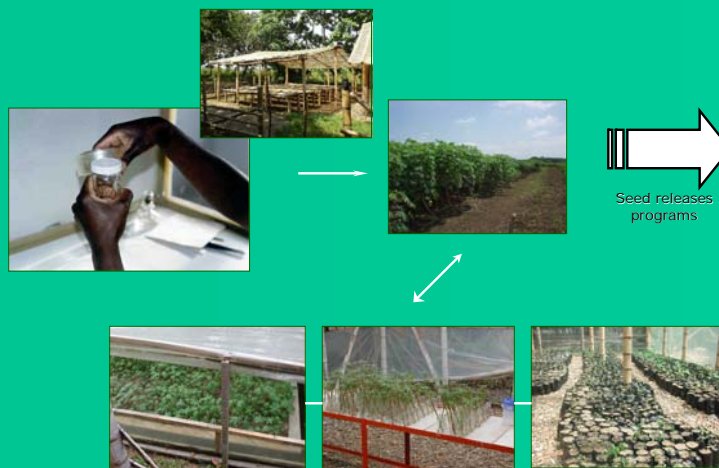
Figure 1: Rural low-cost in-vitro facilities. Rapid propagation and increment field for basic seeds

ICA functionaries certified San Rafael's plot as free frog-skin diseases plants; those materials were planted last years as part of CBN-PRGA supported activities (Escobar et al 2002). Some materials (HMC-1, CM6740-7, MBra 383 CM 523-7) showed highest potential (Figure 1A-B; Table 1).