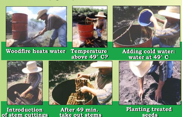
Figure 1. Cassava stakes were rustically treated in hot water by farmers to control diseases and pests.

<u>Thermotherapy:</u> Stakes were immersed for 49 min in water heated to 49 °C over a wood fire ( Figure 1 ).