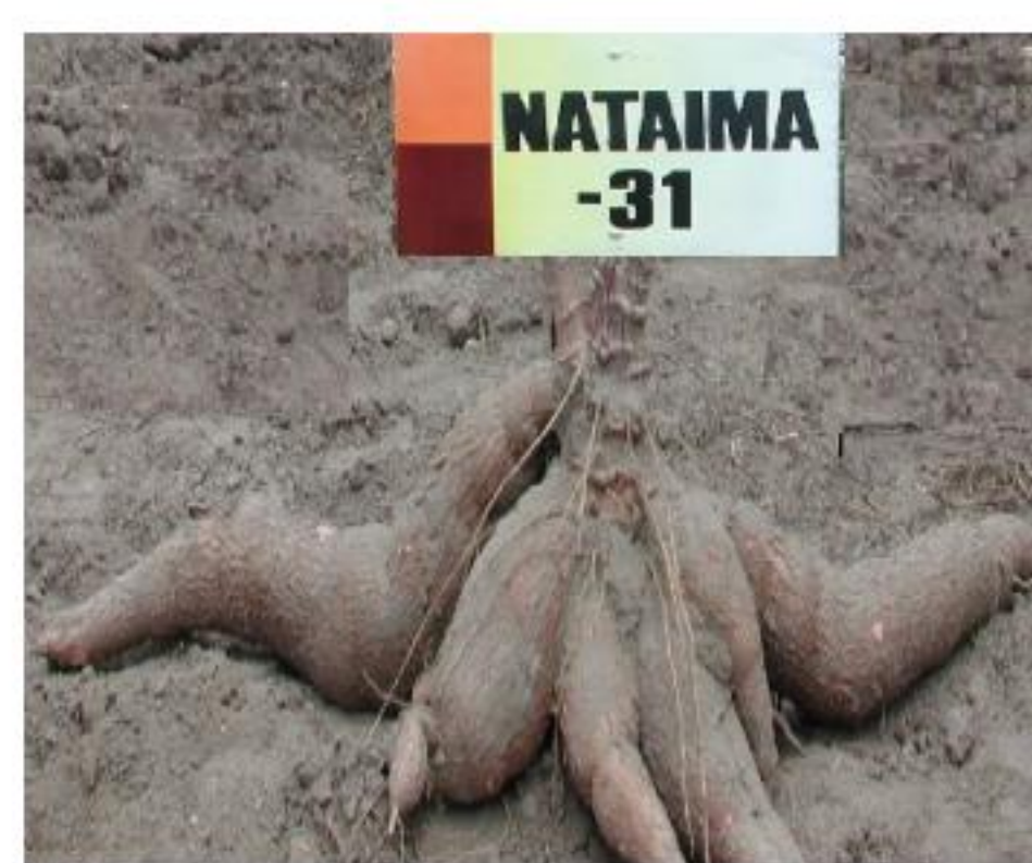
Fig. 3 Root yield, Nataima-31