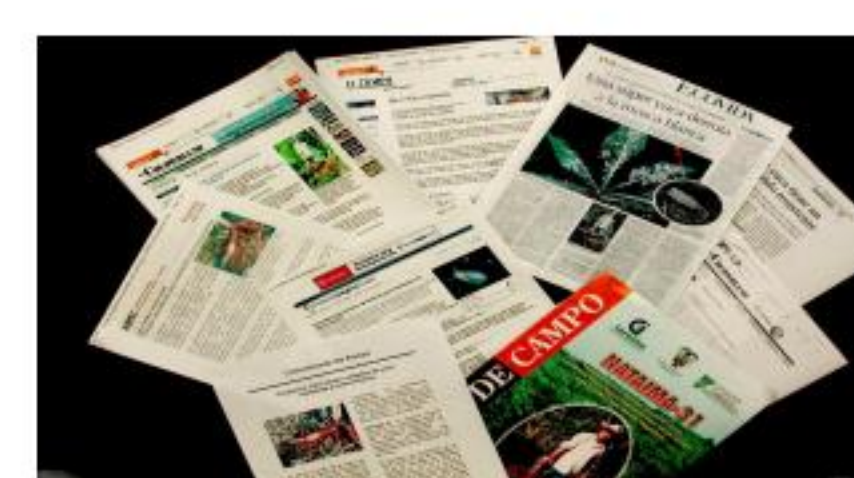
Newspaper Coverage of the Release of Nataima-31

During the field day, participants visited several field plantings of Nataima-31 where plants were harvested and root quality evaluated. Nataima-31 planting material (stem cuttings) was distributed to field day participants, the initial distribution of this variety.