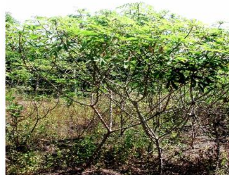
Fig. 2 Nataima-31 plant type

The original cross resulted in 128 progeny and these were evaluated for whitefly resistance, yield and cooking quality at the CORPOICA Research Station in Espinal, Tolima, Colombia. Of the 128 progeny, four (CG 489-34, CG 489-31, CG 489-23 and CG 489-4) were selected for low whitefly populations and no damage as well as the agronomic qualities described above. Nataima-31 is the 31 st progeny of the 128 that were evaluated (Bellotti, 2003).