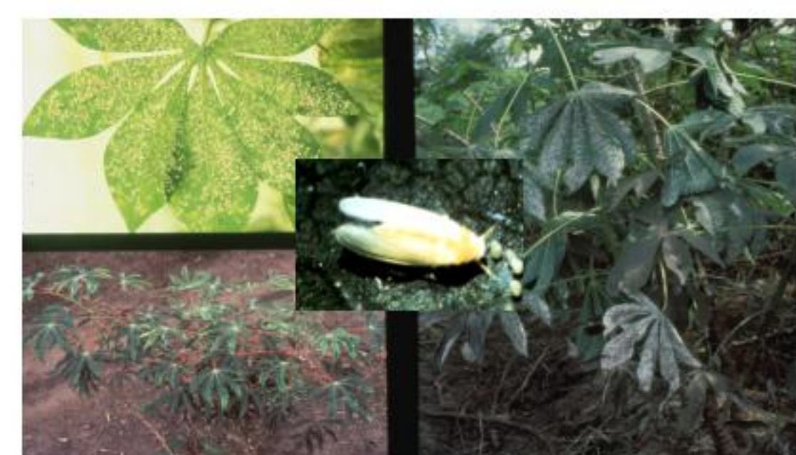
Fig. 1. Population and Damage of A. socialis

In recent years, the whitefly Aleurotrachelus socialis has been a major pest of cassava, causing over 30% yield losses in different regions of Colombia. Due to its short life cycle (30-35 days), A. socialis populations increase rapidly and its ability to develop resistance to pesticides makes chemical control uneconomical. Host plant resistance is sustainable alternative for managing this pest.