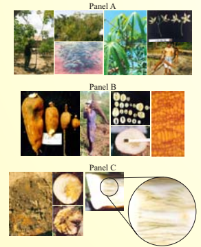
Morphological characterization of sugary cassava type Panel A Overall aspects of a sugary cassava plant and its cultivation in the Amazon. Panel B Some aspects of the storage root of the sugary cassava. Panel C Plague and deterioration observed in the storage root.

Glucose syrup yield: In order to add new value of utilization for cassava a process for extract and concentrate natural glucose from fresh storage root of sugary cassava was developed. Figure 3 shows the yield of 5 to 8% of fresh weight in a industrial pilot process. It is observed that glucose syrup with brix of 49% is obtained from fresh storage root of sugary cassava. Similar product is also obtained from tesh storage root of sugary cassava. Similar product is also obtained from corn and cassava. This new product has great advantage over the commercial product because it is natural and is not derived from any kind of hydrolysis of statch