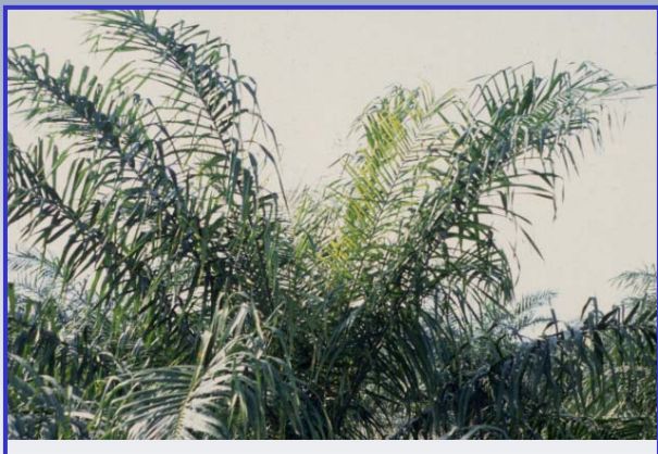
Figure 2. Application of potassium phosphonate (NF) decreased disease severity.

Applications of NF or 40% phosphoric acid, maintained the initially healthy palms with a low disease severity (1.1 to 1.6 according to scale). With the application of 40% phosphoric acid, through root absorption, the production of racemes was increased by 37% in healthy plants and by 23% in diseased plants, although it was not as effective as NF in control of the disease. There were no significant differences between injection to the trunk and root absorption. It was concluded that bud rot could be controlled using inductors of resistance based on potassium and phosphorus, as part of the integrated management of the disease.