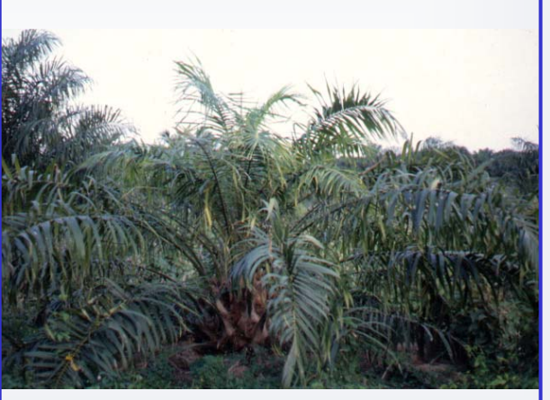
Figure 3. Affected palm with application of water, as control.