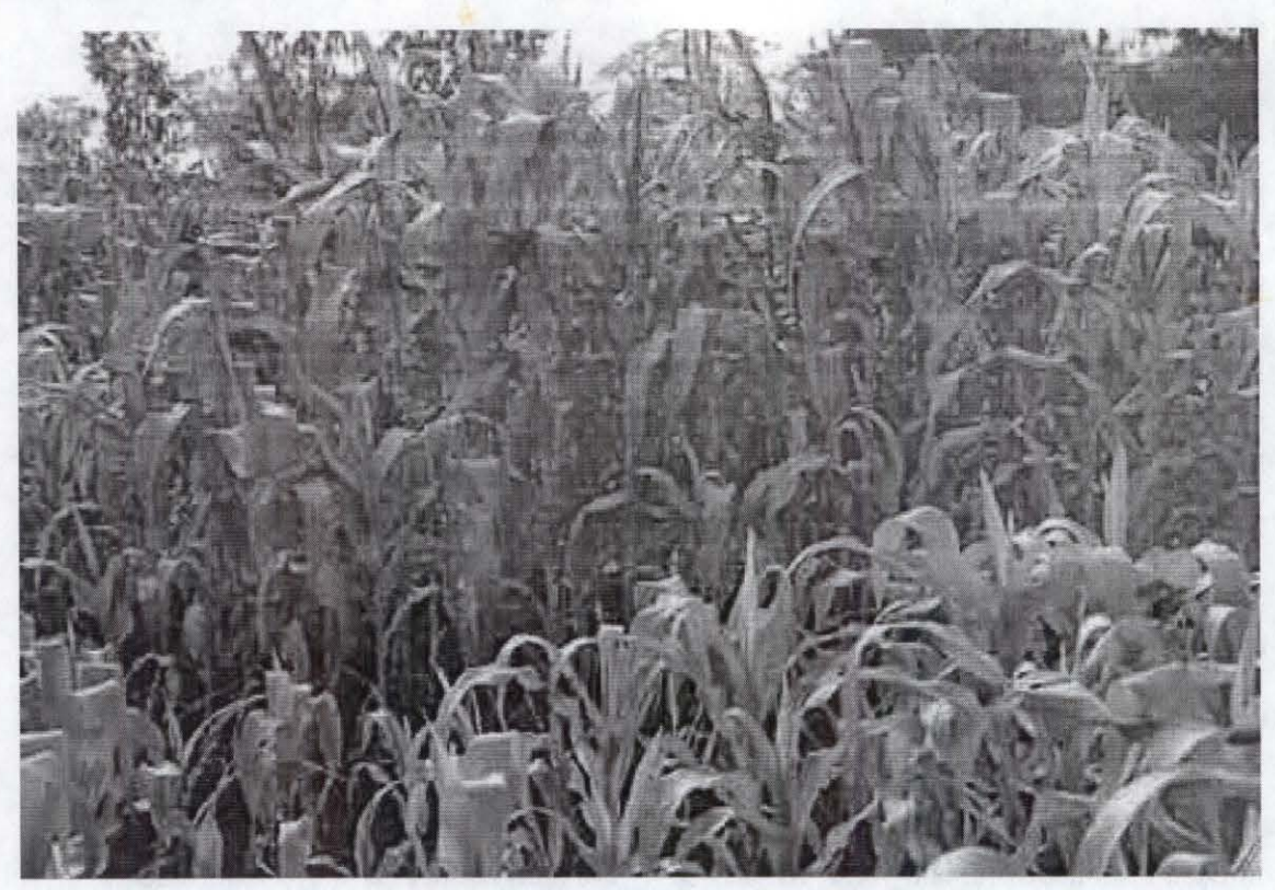
Maize response to INM technologies in Western Kenya: In the foreground is a crop of maize showing N deficiency symptoms and stunted growth while in the background is a health crop