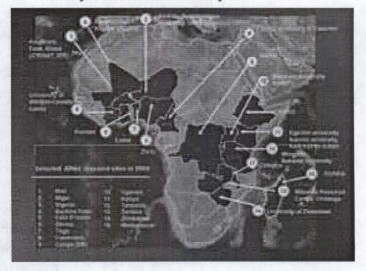
AfNet Bench mark sites in Africa

There are about 80 sites of network trials in different agro-ecological zones distributed