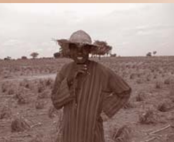
Back cover: A farmer in his farm in West Africa.