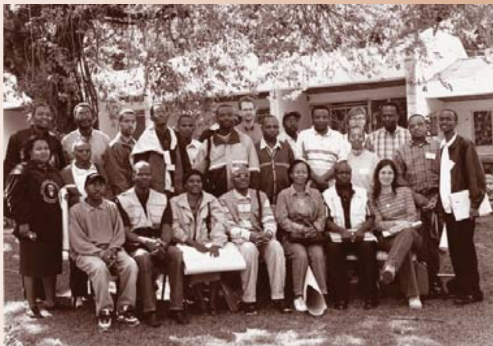
Participants at the AfNet NUTMON training workshop.

For more information on these activities, contact by Edgar Amézquita (e.amezquita@cgiar.org)