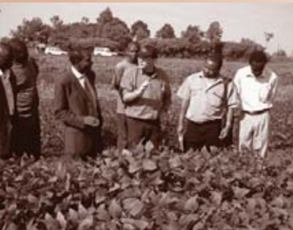
Front cover: TSBF-CIAT scientists and policy makers visit our field sites in western Kenya.