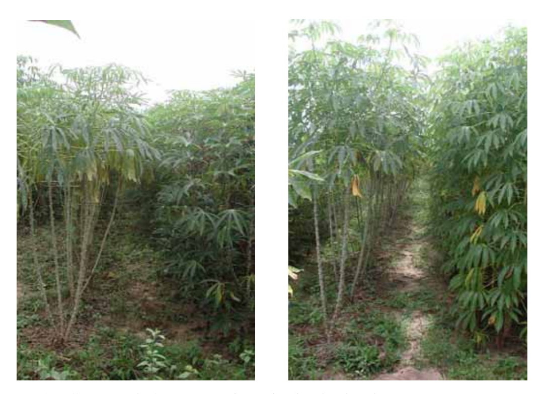
Figure 3. Differences in leaf retention as observed in the Clonal Evaluation at Santo Tomás, Department of Atlántico, Colombia. At 5½ months, some families were retaining leaves while others had significant leaf fall.