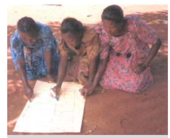
Figure 1. Farmers drawing a resource flow map.

2.Estimate the nutrient balances at farm and farm sub-system levels and their impact on the sustainable productivity of this farming system. Eighteen farmers representing three soil fertility management classes (1=good, 2=average and 3=poor managers), in three villages, were chosen as test farmers for intensive on-farm resource flow mapping.