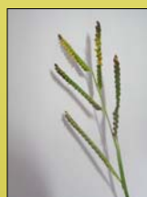
Panicle with 4 or 6 racemes that present cream-white stigmas at anthesis

Mulato II has antibiotic resistance to several spittlebug species such as Aeneolamia reducta , A. varia , Zulia carbonaria , Z. pubescens , Prosapia simulans , Mahanarva trifissa , Deois flavopicta , D. schach , and Notozulia entrerriana . and has exhibited moderate susceptibility to fungal leaf diseases.