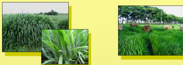
Highly pubescent and strong stems and intense green lanceolate leaves

Brachiaria hybrid cultivar (cv.) Mulato II (CIAT 36087) is the product of three generations of crosses and screening carried out by the Tropical Forages Project of CIAT since 1989 between Brachiaria ruziziensis (sexual tetraploid), B. decumbens and B. brizantha (apomictic tetraploid).