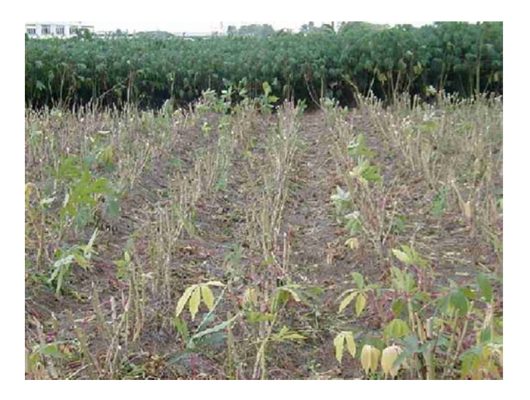
Photo 2. Cassava field after the mechanical harvest, Candelaria, Valle, Colombia.