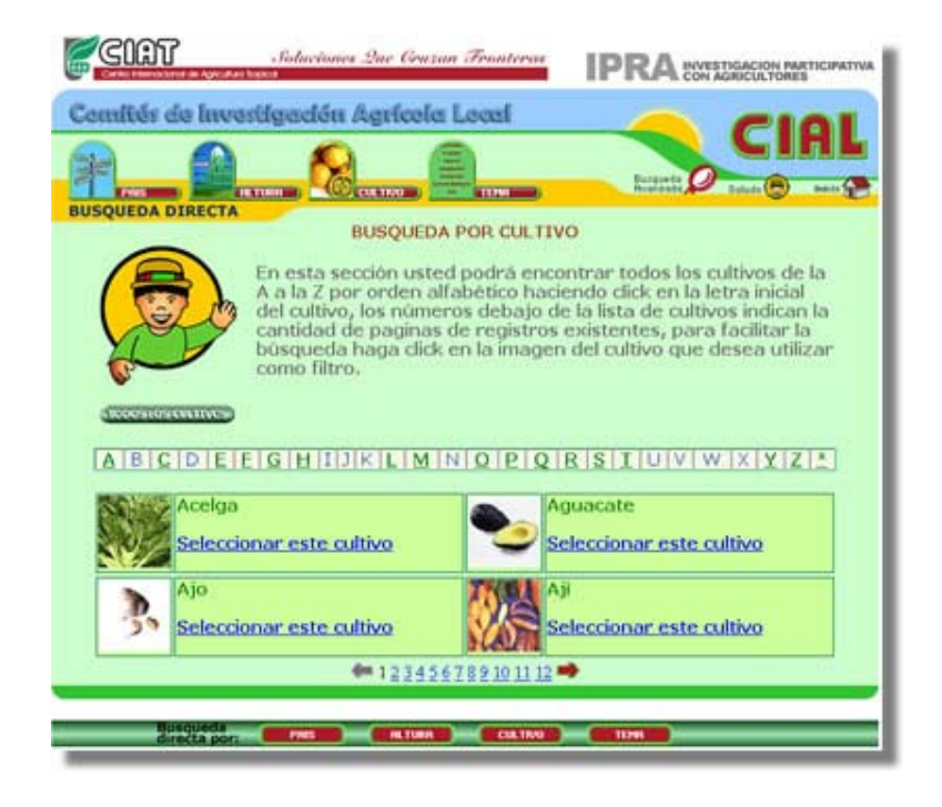
Figure 6. How to look for information through different kind of crop researched by CIALs.

By crop. This alternative provides the visitor with the names of the crops being researched by the farmers through their CIALs, organized in alphabetical order. The visitor selects the letter corresponding to the first letter of the name of the crop of their interest so that the tool generates as a result all the crops whose name begins with the letter selected as well as the CIALs that have done research on them. (Figure 6)