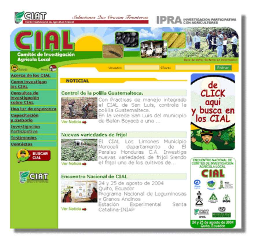
Figure 2. NotiCIAL, where user can find updated news about CIALs.