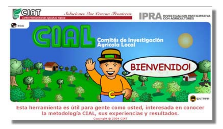
Figure 1. Enl@ceCIAL Home.

The experiences of the CIALs in Colombia, Ecuador, Bolivia, Honduras and Nicaragua have been recorded and documented since their beginning in 1990 through a database containing the results of the research developed by the farmers and supplied by many technicians from institutions in Latin America.