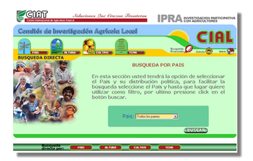
Figure 4. How to look for information through country.

By country. This option permits the users to select the country of their interest from among Colombia, Ecuador, Bolivia, Honduras and Nicaragua; and within these, the province, state or specific locality that they wish to access. Then the gives list tool a committees that operate in the zone selected by the visitor and also provides detailed information on each CIAL. (Figure 4)