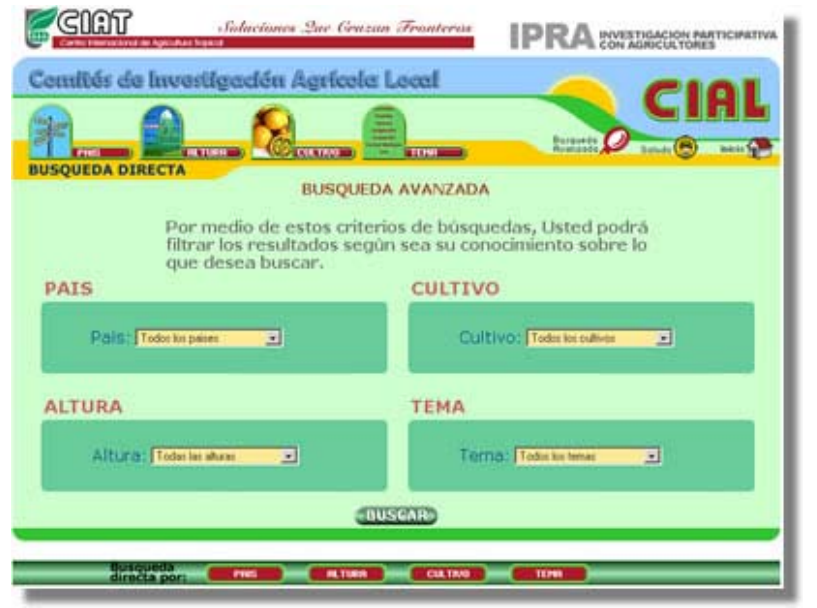
Figure 8. How to select different options using advanced search.

Advanced search: This option offers the visitor the possibility of using criteria such as country, altitude, crop and topic simultaneously. When the user has selected options in each criterion, the tool generates a list of the CIALs that meet with all the criteria. (Figure 8)