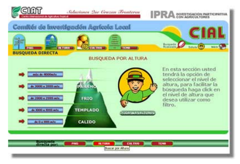
By altitude. Here the user can develop his/her search based on the criterion of altitude, which the options offers warm, temperate, cold and paramo. Depending on their selection, the tool again generates a list with the names and principal characteristics of the CIALs existing in these regions. (Figure 5)