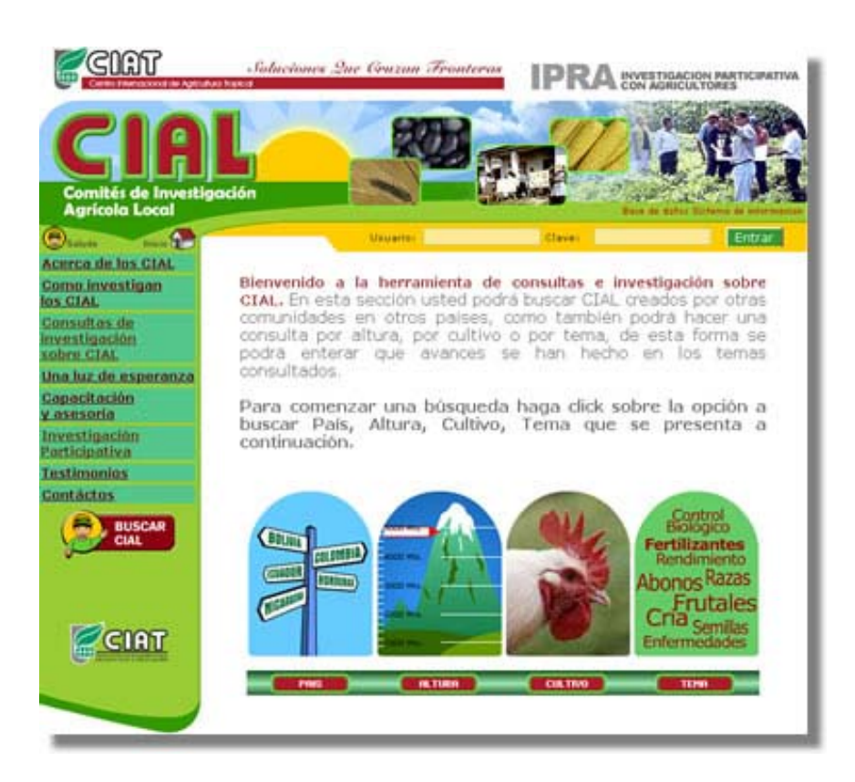
Figure 3. This tool offer four ways to look for information about CIALs research.

This is where the greater part of the information that was previously stored in the old database is available. It is here where the user has the didactic support of a demo that indicates the different paths for consulting so that they can access the information of their interest. These are: